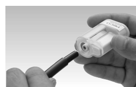
Tube Stripper for Anti-spatter Tube