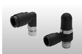
Tube Fitting Anti-spatter